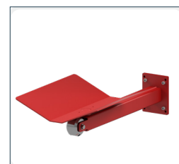
Boom with wheel + V support