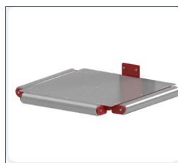
Platform with rollers