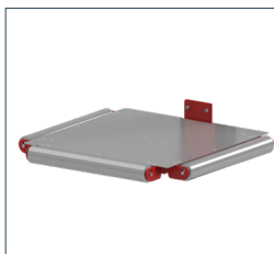
Platform with rollers